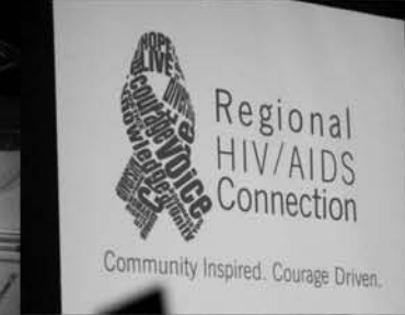
Regional HIV/AIDS Connection Community Inspired. Courage Driven.