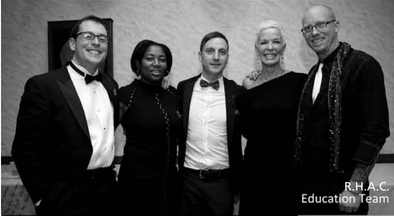
R.H.A.C. Education Team