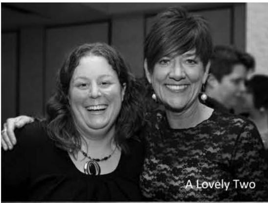
A Lovely Two