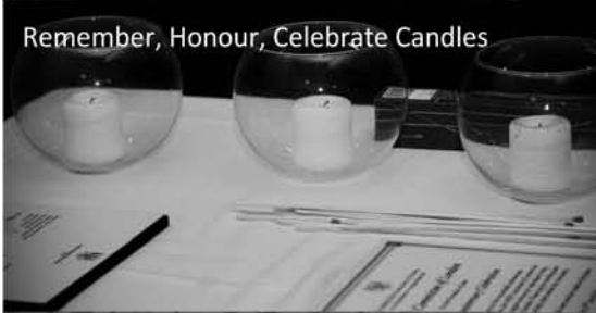
Remember, Honour, Celebrate Candles