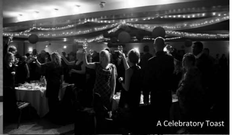
A Celebratory Toast